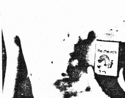
FIGURE 2: Photograph of the patient's chest which was taken on July 7, 1977.

Indian ashram. He had short sessions of radiation therapy, and chemotherapy, but declined to continue treatment. He has also persisted with the dietary and enema