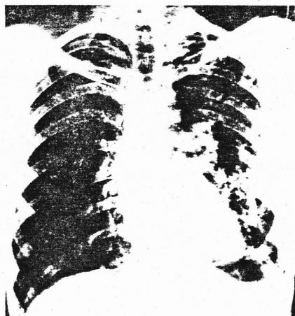
FIGURE 1: Chest X-ray film taken on October 19, 1976.

THE PATIENT, aged 25, underwent a mid-thigh amputation for osteogenic sarcoma 11 months before he first saw me 2½ years ago. He had visible bony lumps of about 2 cm in diameter growing from the ribs, sternum and the crest of the ilium, and was coughing up small quantities of blood in which, he said, he could feel small spicules of bone. There were gross opacities in the X-ray films of his lungs. The patient had been told by a specialist that he had only two or three weeks to live, but in virtue of his profession he was already well aware of the pathology and prognosis of his condition. Now, 2½ years later, he has moved to another State to resume his former occupation.